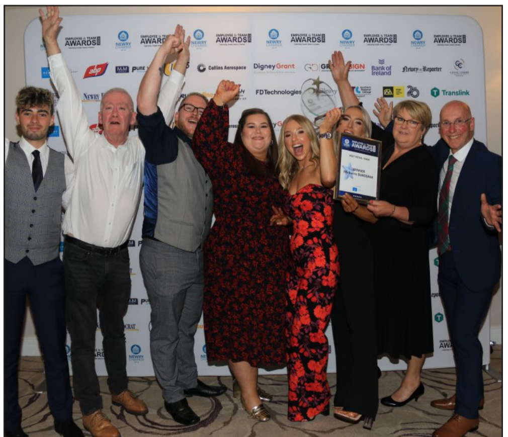
Mulkerns Eurospar Winners of the Best Retail Team award celebrate their success at Newry Chamber of Commerce & Trade Employee and Team Awards Ceremony.